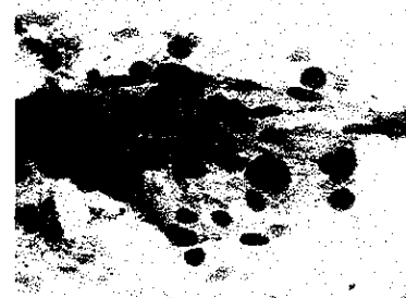
Specimen 1: Thyroid, right lower nodule PAP: Hurthle cells with nuclear size variation